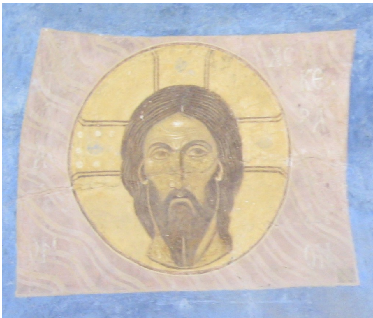
Holy Keramion —Transfiguration Cathedral, Mirozh Monastery, Pskov, Russia (ca. 1140).