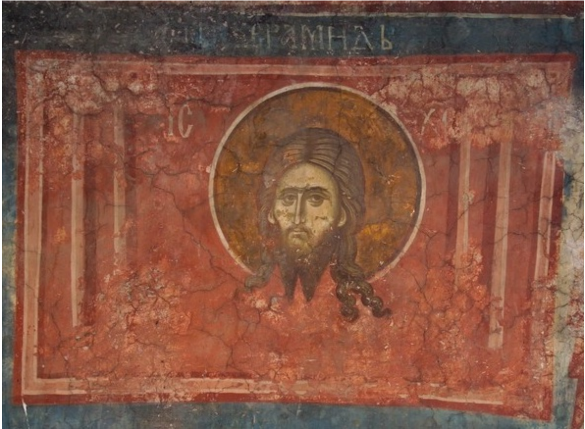
Holy Keramion —Visoki Dečani monastery, Kosovo, Serbia (ca. 1335).

Often, as mentioned above, both the Holy Mandylion and Holy Keramion appear together in the same church. As an illustration of this, following below find an example of the pair from the Transfiguration Cathedral of the Mirozh Monastery in Pskov, Russia. (Forgive the distortion—I was not quite able to “flatten” these images (remove the perspective) from the original photographs.) It might be noted that these two Icons face each other across the nave as a reminder that the image on the tile is an impress of the original on the napkin (typical practice when both Icons appear together).