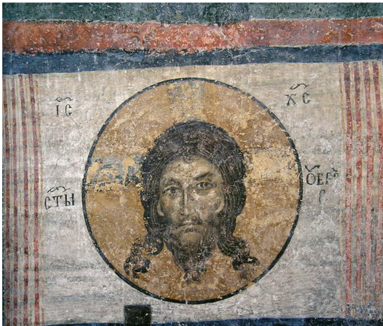
Holy Mandylion—Boyana Church, Sofia, Bulgaria (1259).