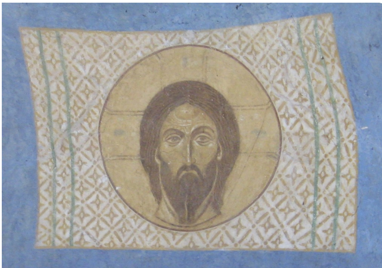
Holy Mandylion—Transfiguration Cathedral, Mirozh Monastery, Pskov, Russia (ca. 1140).